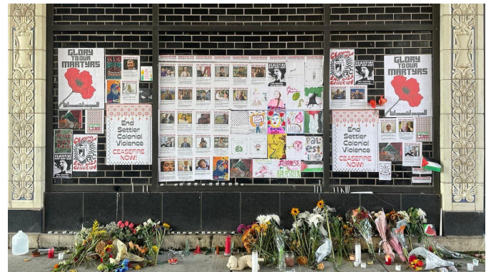
Memorial for people killed in Gaza, on Leland & Broadway, Uptown Chicago. Let's pray for Peace and a ceasefire!

IF YOU KNOW YOUR GREEK MYTHS YOU KNOW THEY HAD A LIKING FOR INVENTIVE IRONIC PUNISHMENTS. PROMETHEUS STOLE FIRE FROM THE GODS AND WAS CHAINED TO A ROCK AND EAGLES ATE HIS LIVER EVERY NIGHT, CASSANDRA COULD FORETELL THE FUTURE BUT NO ONE WOULD BELIEVE HER PROPHECIES. NARCISSUS LOVED HIS OWN BEAUTY TOO MUCH AND WAS TURNED INTO A FLOWER FOREVER GAZING AT ITS REFLECTION. SISYPHUS... I DON'T REMEMBER WHAT HE DID TO OFFEND THE GODS, BUT HE HAD TO PUSH A BIG ROCK UPHILL, ONLY TO HAVE IT ROLL TO THE BOTTOM AGAIN AND AGAIN. YES, THOSE GREEKS HAD A FLAIR FOR IRONY AND A LIVELY SADISTIC IMAGINATION. WHICH BRINGS US TO THE CATHOLIC WORKER: HERE I AM TRAPPED WITH AN ASSORTMENT OF COLUSSALLY ANNOYING PEOPLE EACH OF WHOM POSSESSES SOME QUALITY THAT INESCAPABLY REMINDS ME OF MY VERY OWN YOUNGER SELF. NICE WORK, GREEK GODS! WHO KNEW YOU WERE STILL IN CHARGE?